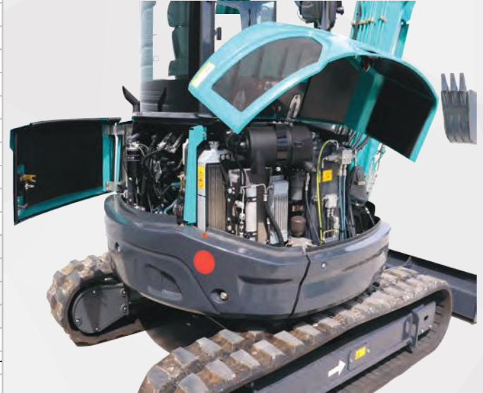
Kubota Engine with easy access panels for quick engine maintenance Features Zero-Tail Swing