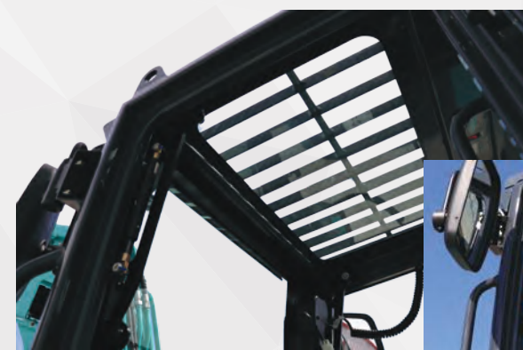
Rock Guard for protection