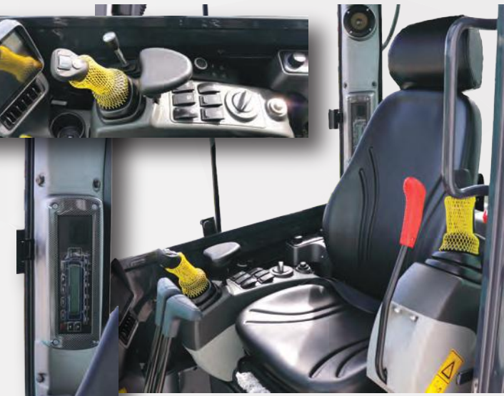
Enclosed cab with A/C, Touchscreen Monitor, Rock Guard and removable windows